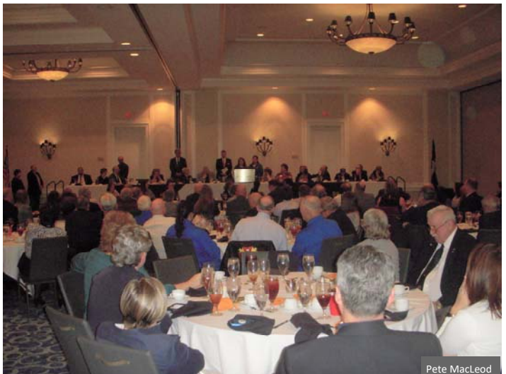
The banquet was well attended and the winners did not know their placement until their names were announced.