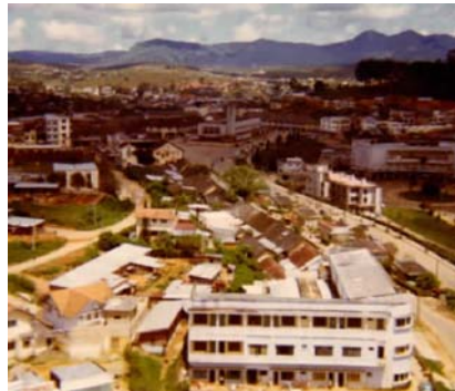
Da Lat City

almost chilly. That's what it was like in late September and early October of 1970. We boarded a chopper in Phan Thiet for about a two-hour ride straight inland. The