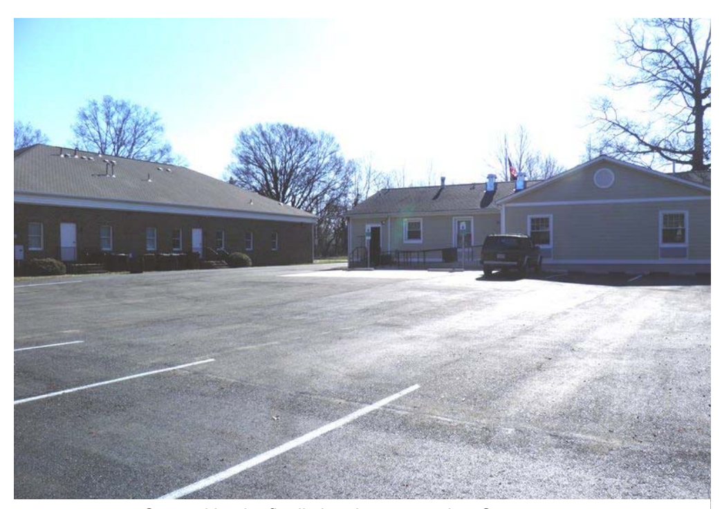
Our parking lot finally has been paved — See page 7.