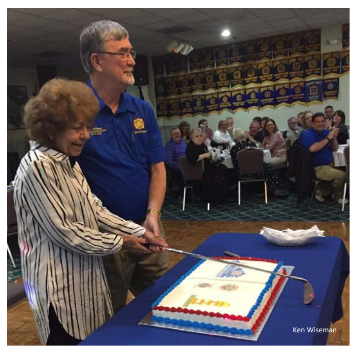
When the State Commander is an Air Force pilot you give him a putter to cut