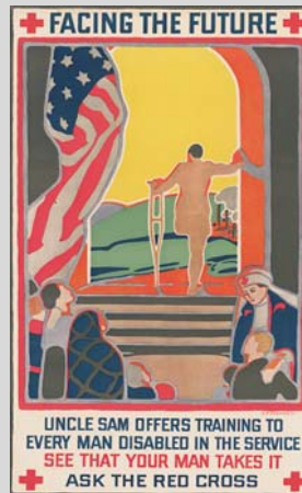
Facing the Future (1919)