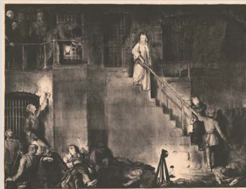
The Murder of Edith Cavell (1918)

Though not by a well-known artist, this stunning poster is one of our favorites. Through a series of visual choices, it conveys complex content and emotions. For example, the artist leads our eyes past the foreground using progressively brighter colors until they surround the amputee veteran, haloed in white and literally standing on a threshold.