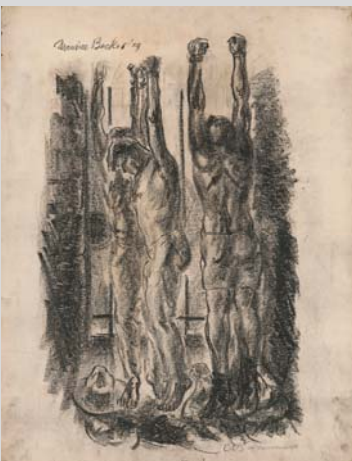
C. O.’s [sic] in Leavenworth (1919)

Uncle Sam but how many realize it was created just before the United States entered World War I and repurposed during World War II? We are fascinated by the artist’s story of using his own face for the now-iconic image of Uncle Sam to save on modeling fees.