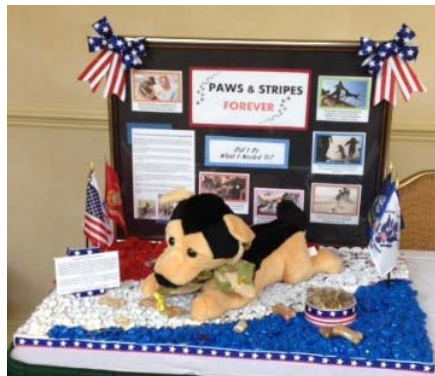
Auxiliary 7589 Buddy Poppy Display

and it will be going to Pittsburgh, PA to compete at the National Convention. We received certificates for Flag Presentation and the 2015-2016 Early Bird Parade.