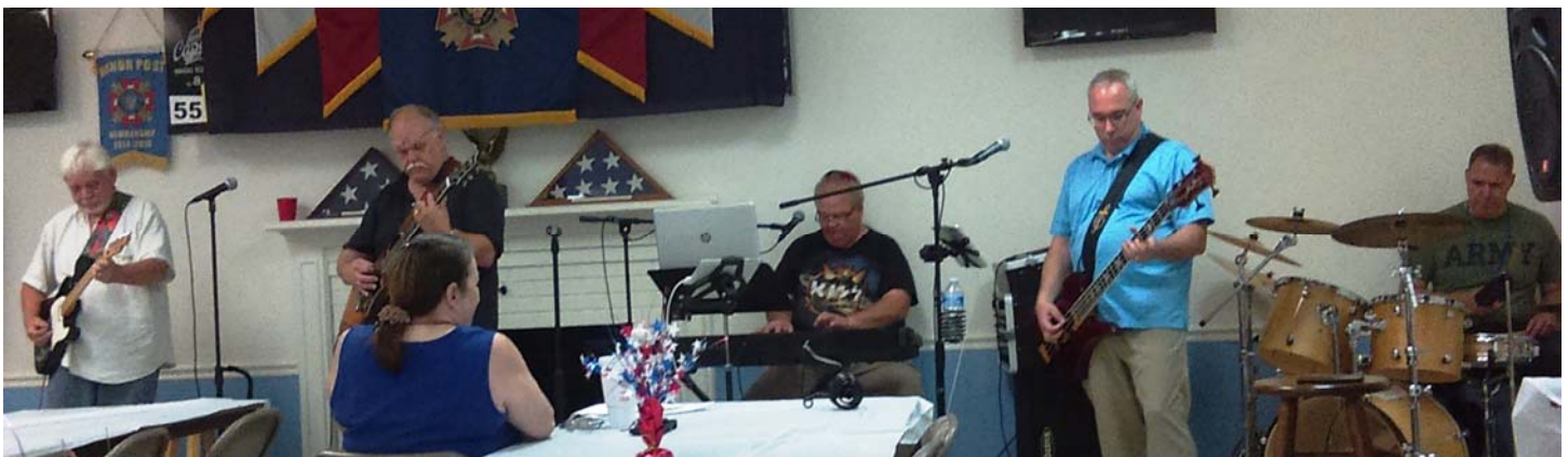
We even had a band volunteer to play at our June 6th Post Anniversary Vietnam 50th Commemoration BBQ.

Contact: Wayne Moore 571-285-7904 Visit our website: www.vfw7589.org