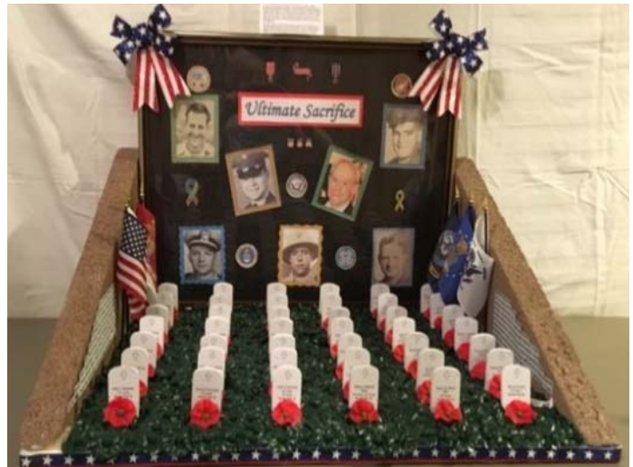
Auxiliary 7589 Buddy Poppy Display, June 2016