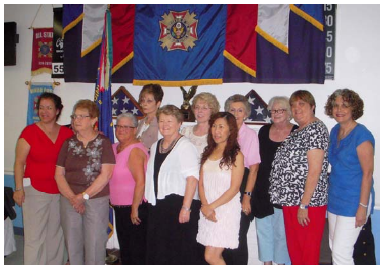
Members of the Post Auxiliary assisted with logistics — not a small task!