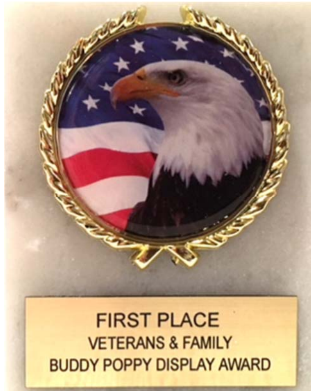
The Auxiliary's Buddy Poppy display won 1st place at the State convention. See Page 4.

Francis Cannon VFW Post 7589 Manassas, Virginia July 2018