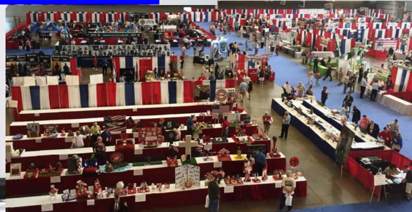
The exhibit hall