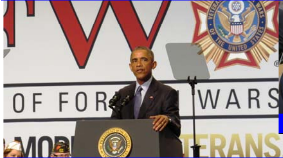
President Obama addresses the convention on July 21.