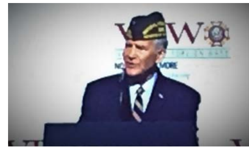
LTC Oliver North