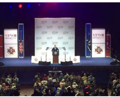
President Donald Trump