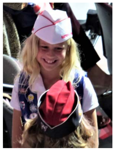
The 2018 Buddy Poppy Child accepts a donation to the VFW National Home