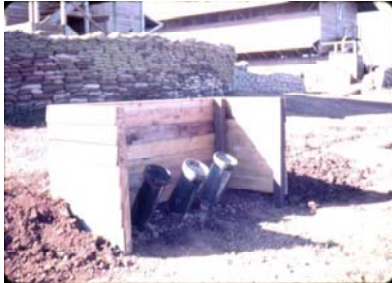
Vietnam era urinal — a 3-tuber Photo by Rick Raskin—1967

As a Vietnam combat platoon leader, having women assigned to my unit would have added a significant burden to my already overloaded rucksack. Small element leadership in ground combat is difficult enough without adding things like hygienic needs for women, weapon assignments, sleeping arrangements and a host of other issues to contend with. At firebases our showers were five gallon buckets on a stand with holes punched in