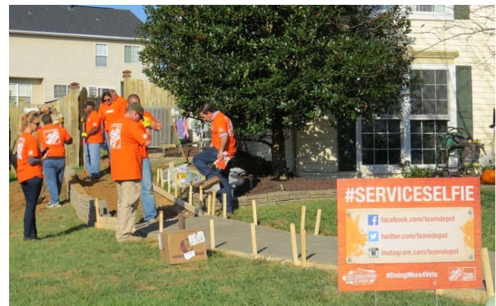
The concrete rear access ramp under construction.