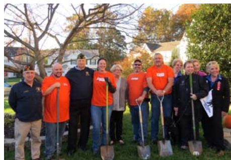
VFW and Auxiliary members break ground with Team Home Depot.

On the morning of October 22 a groundbreaking ceremony was held at the Towne’s home.