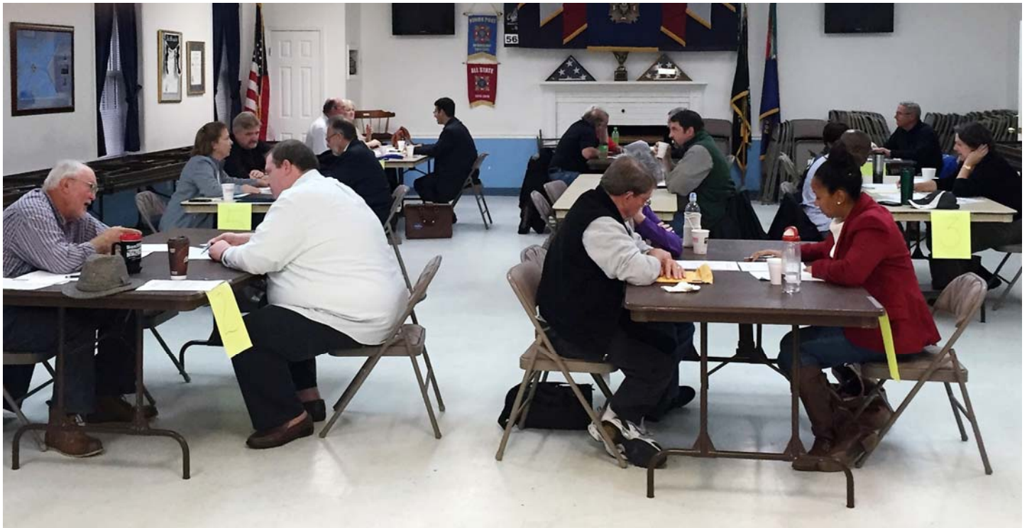
October 3: Veterans meet with attorneys at the second session of the Wills for Veterans program.

Francis Cannon VFW Post 7589 Manassas, Virginia November 2015