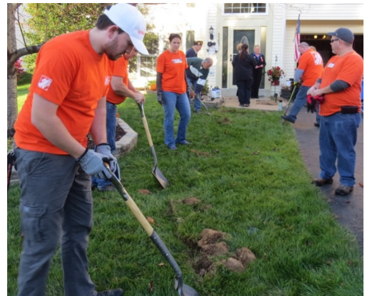
Construction of the entry ramp begins with some serious shovel work.