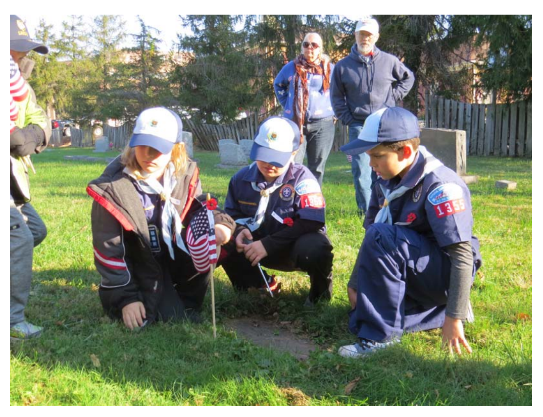
November 11: Scouts from Pack 1355 place a flag at a veteran's grave at the Manassas Cemetery.