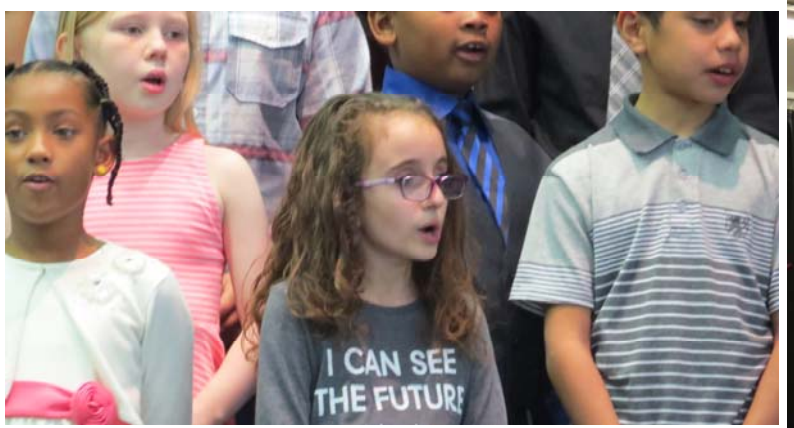
This student's tee-shirt says it all.