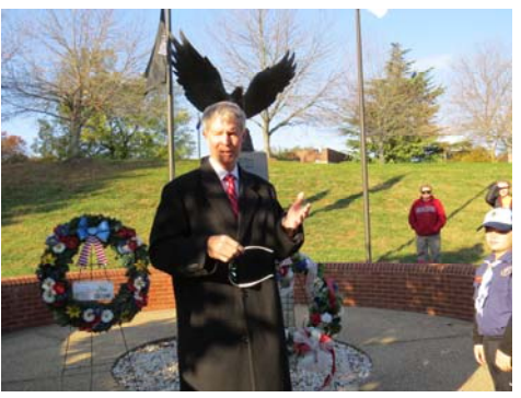
Manassas Mayor Hal Parrish