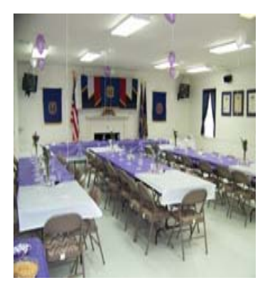
Public Rental Rates $200.00 for the 1st two hours $ 75.00 for each additional hour

Friday & Saturday Nights minimum Rental is 4 hours for $400.00