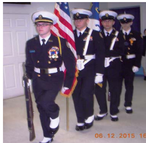
Osborn Park HS Junior Navy ROTC Color Guard at the awards ceremony on December 6.