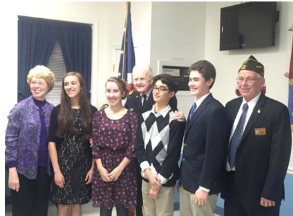
Voice of Democracy winners at our December 6 awards ceremony.