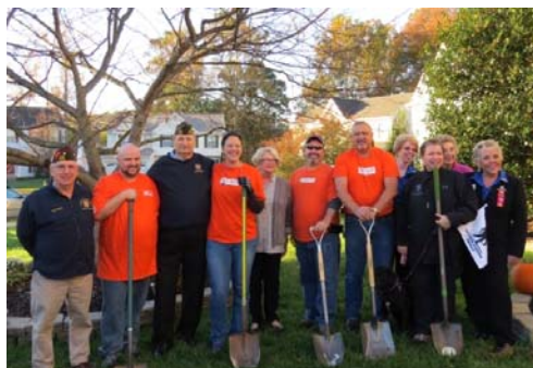
VFW and Auxiliary members break ground with Team Home Depot.