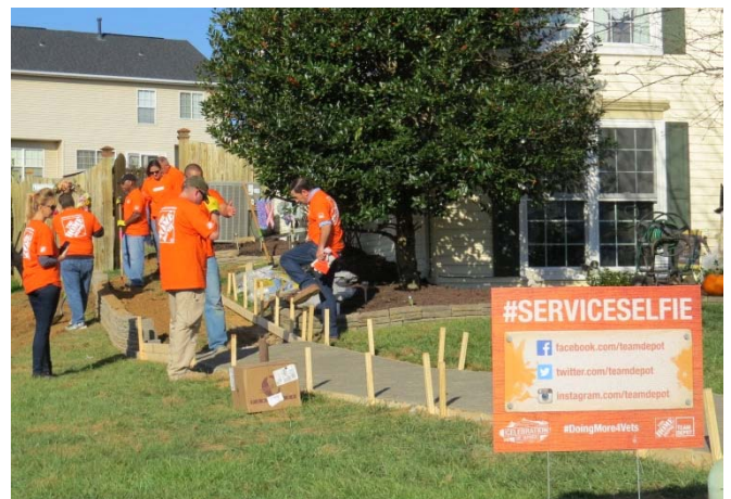
The concrete rear access ramp under construction.