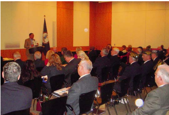
(Left) Attendees at the Joint Leadership Council meeting following Day on the Hill in DC.