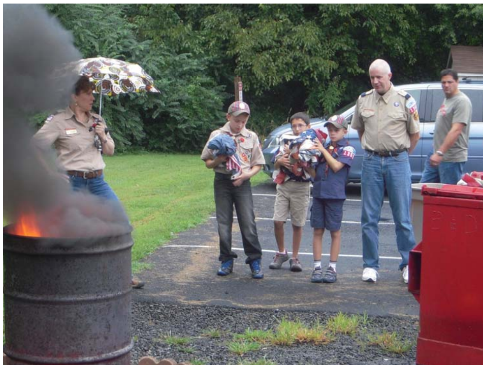
Cub Scouts from Bennett Elementary School Pack 1355 assisted with our flag retirement ceremony on September 12. Ten Scouts were present for the event which included instruction about the American flag.