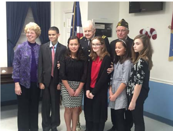
Patriots Pen winners at our December 6 awards ceremony.