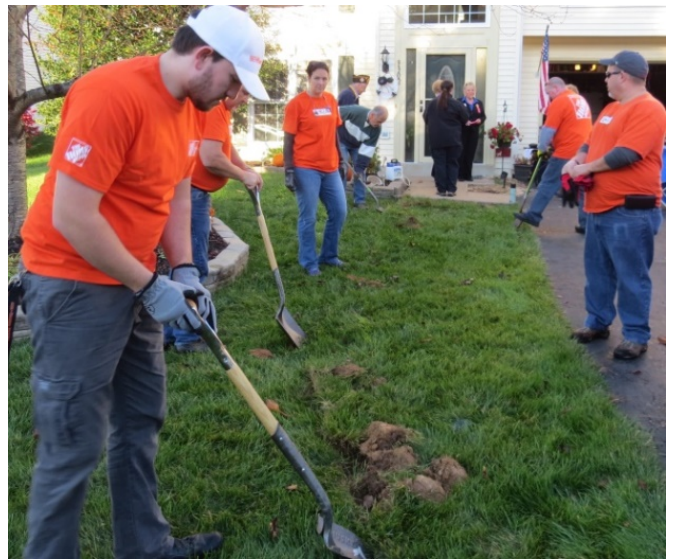
Construction of the entry ramp begins with some serious shovel work.

Veterans needing assistance with similar needs are encouraged to contact a Home Depot manager to see if they qualify and to initiate a request.