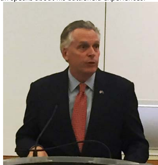
Governor Terry McAuliffe addresses the Joint Leadership Council meeting in Richmond following our meetings with legislators.