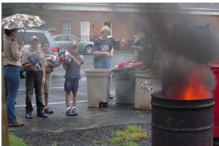
Cub Scouts from Pack 1355 assist with our flag retirement ceremony on September 12. Ten Scouts were present for the event.