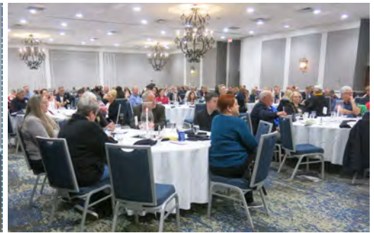
Opening ceremonies at the well attended annual awards banquet