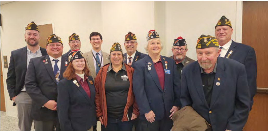
Part of the VFW team that descended on the Capitol for the Day on the Hill