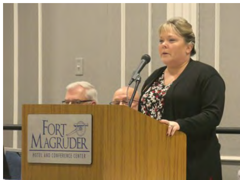
Teacher of the Year 6-8