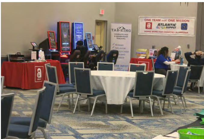
Several gaming vendors had displays of their latest offerings.