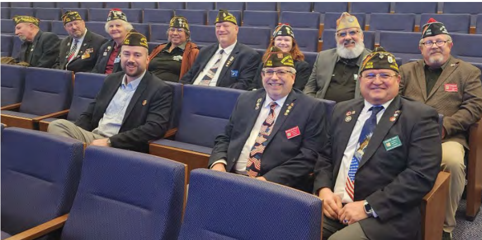
VFW members made a strong showing at a hearing at the House of Delegates