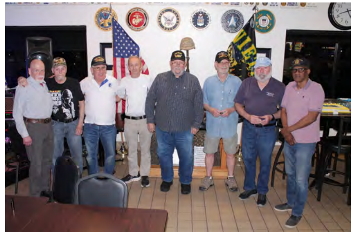
Vietnam veterans who attended the ceremony