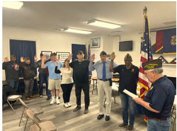
Post officers for 2025-26 were elected and installed on April 7