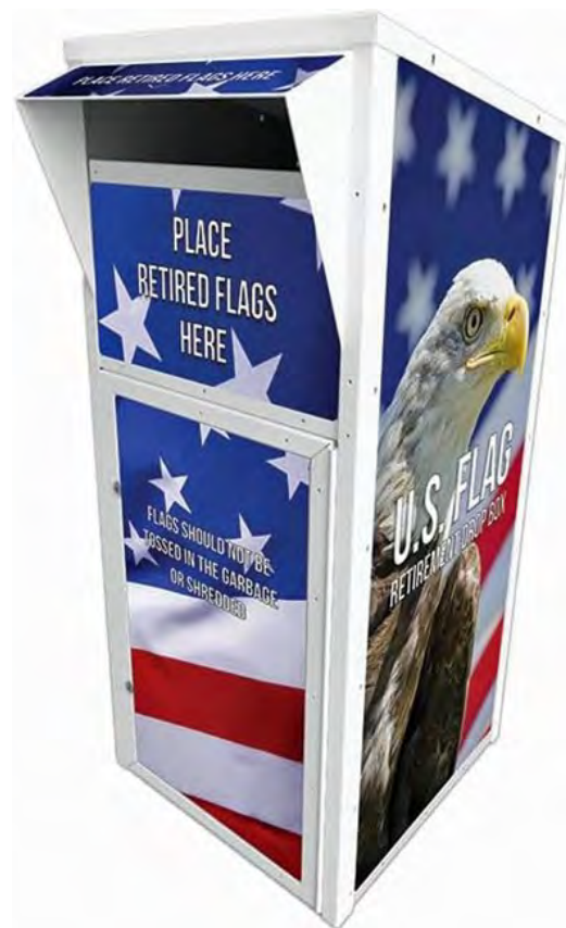
A new flag retirement box at the Post replaces the older wooden one that had become unserviceable.