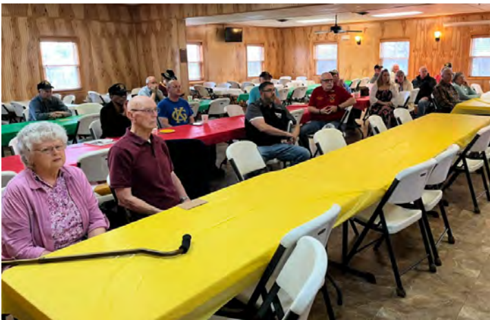
All the tables at Culpeper were decorated with the colors of the South Vietnam flag