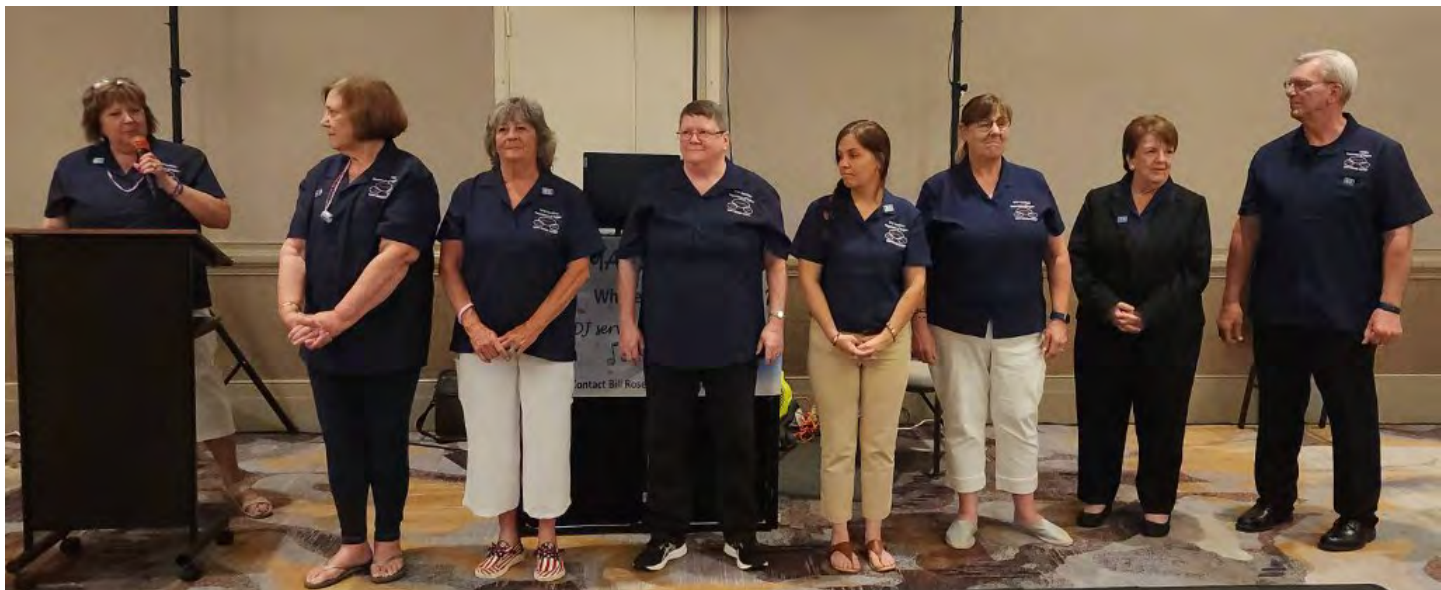
Auxiliary Line Officers for the 2025-2026 year.