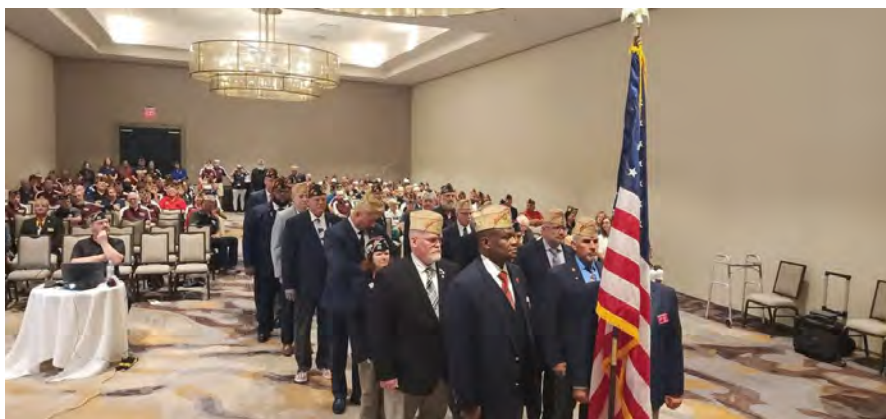
Installation of 2025-2026 District Commanders and Line Officers.