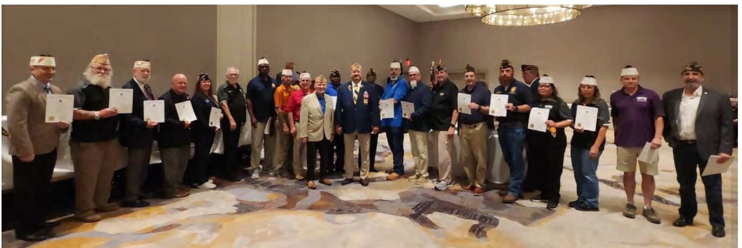
All-State Quartermasters line up at the awards ceremony.