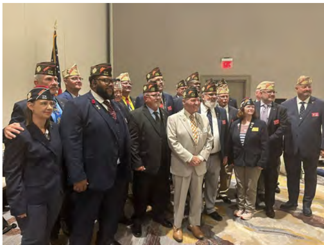
Line officers for the 2025-2026 year.