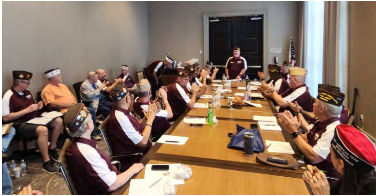
Council of Administration meeting prior to the convention.