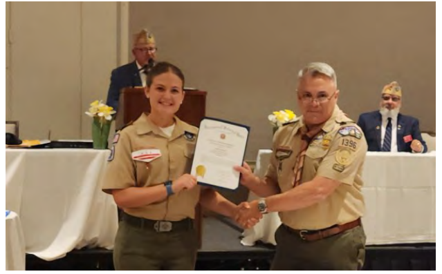
VFW Virginia's Scout of the Year.