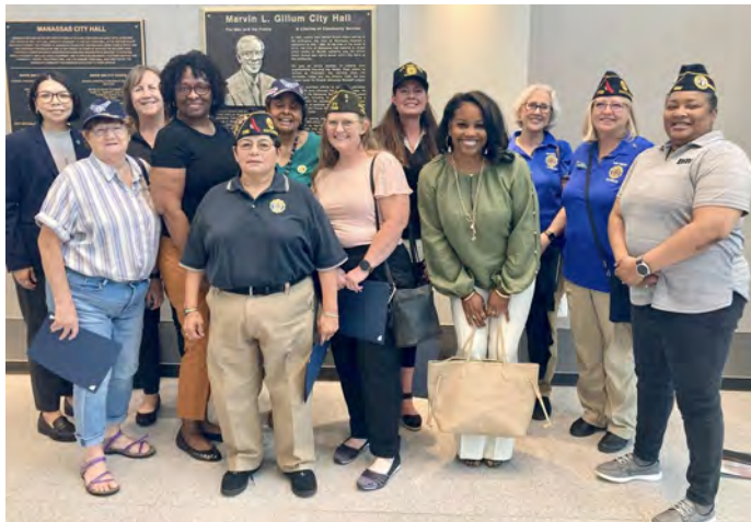
Women Veterans who attended the ceremony.